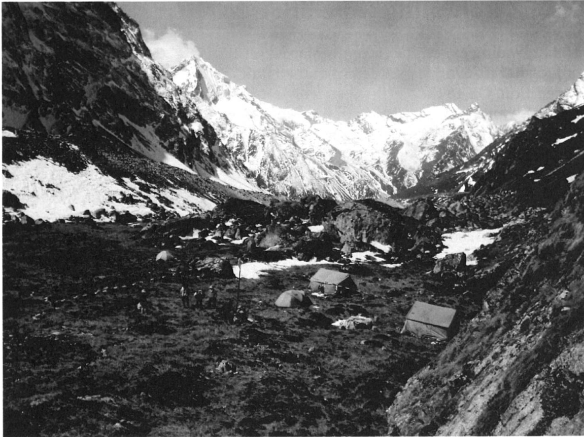
Our basecamp at ca. 5000m.

that?" Ratomate was our first and last chance for a swim in semi-temperate river water, and marked a sudden change of pace to steady trekking. On the next morning we were greeted at breakfast by some local Maoist rebels, one carrying a concealed revolver, who asked us for "entrance fees" of 3000Rs per person to an area they controlled; we paid 2000Rs ($28) each in exchange for a stamped chit authorising our presence. Fortunately they were not demanding that our porters or staff pay anything, as this might have led to a less civil response on my part. The rebels also made good stereotypes of their role - Nepalese society's bottom-feeders who have found it easier to make a living from threats than from work. The trek took us along the rushing blue waters of the Bhote Kosi in hot and hazy spring weather, first north-eastwards through Singati to Suri Dobhan, where we played volleyball with the porters and local children, then northwards to Chetchet where we laid off a sick porter with a spreading and contagious skin ailment. Our porters were trying hard to win, rather than lose, a half day offset with the only camps