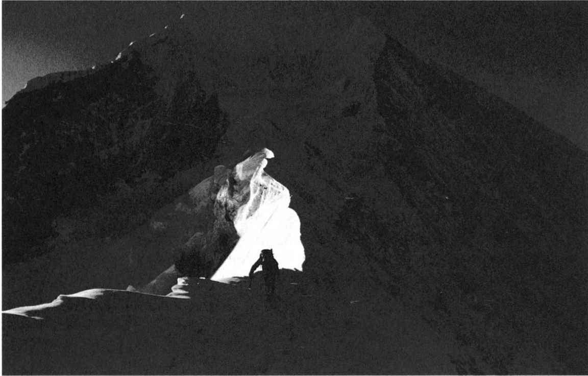
NW-Face of Chekigo (6257m) and NW-Ridge.

hydrated and clean even under the most miserable circumstances.