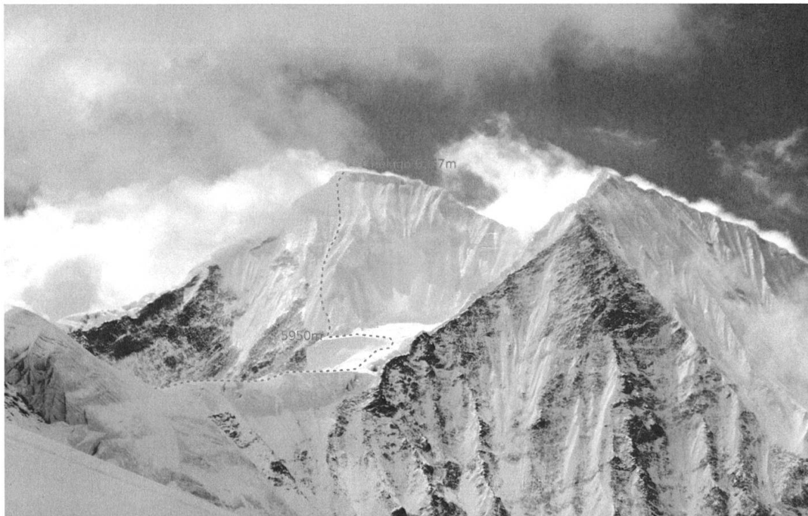
NW-Face of Chekigo (6257m) with ascent route.