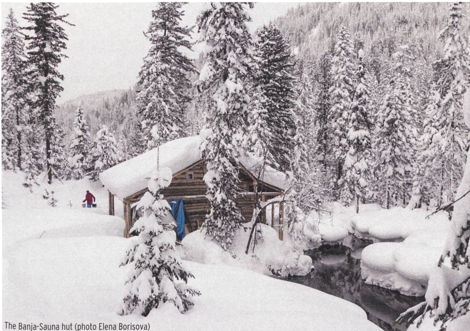
The Banja-Sauna hut