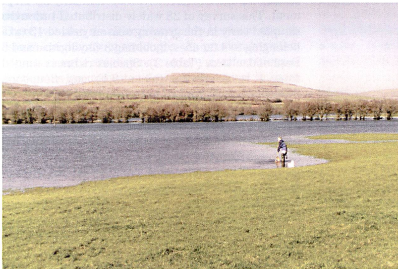
Fig. 3: Turloughmore. This recently flooded turlough in the Burren, Co. Clare, shows hedges extending into the water.

Entomostracans were sampled from the leeward side of each turlough at a depth of approximately 30 cm, and from a range of the habitats present (vegetation, open water, accumulated detritus, flooded hedgerows etc.), using a standard FBA style pond net with a 100 \mu\text{m} mesh net. Entomostracan samples consisted of 10 standard sweeps, each involving sweeping the net forwards along a one meter long path, then back along the same, disturbed path, completed in two seconds. Samples were preserved in 70% alcohol (IMS). In the laboratory any contained plant matter and macroinvertebrates were recorded and then separated from the sample using a coarse sieve. Suspended materials were concentrated with a fine sieve and their settled volume recorded. Water was added to make up to a known volume (usually 50 ml) and a sub-sample of 2.5ml was examined. Unrecognised cladocerans were mounted in lactophenol with lignin pink for identification. All cladocerans were then counted in a grooved counting disc under a binocular dissecting microscope at x200 magnification. If the sub-sample contained 100 or more of the most abundant cladoceran species, the sample was considered complete, otherwise further sub-samples were counted until a number greater than 100 of one species was recorded.