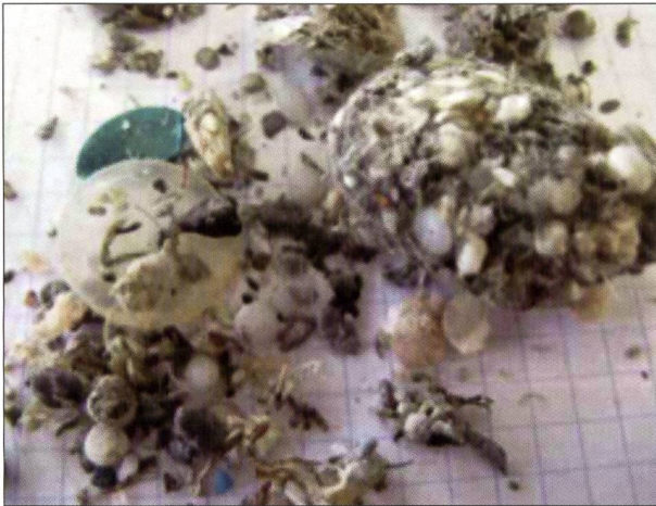
Fig. 9. Common gull faeces found in Vidz, containing mainly polystyrene.

nomena; temporal and seasonal variations are also to be taken into account, as well as the weather, regarding water flow and plastic distribution.