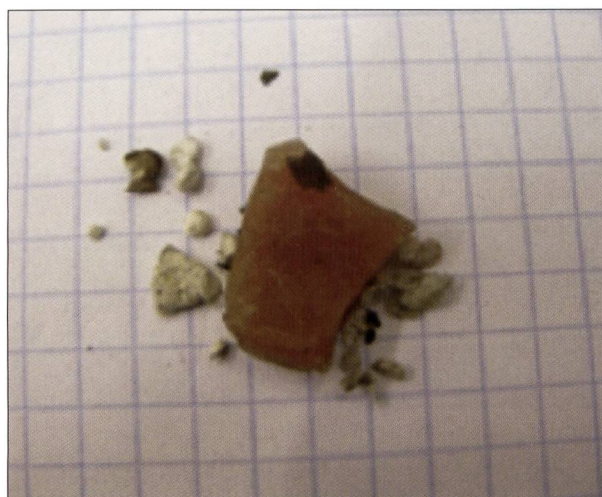
Fig. 2. Plastic pieces found on the beach of St Sulpice, high water line.

Samples from both the Mediterranean and Lake Geneva have been collected and analyzed using a protocol developed by the Algalita Foundation 2 and the 5-Gyres Institute 3 . The floating “Manta trawl”, shown on Fig. 1 is specifically designed to sample the upper part of water bodies. Equipped with a plankton sieve (300 \mu\text{m} ), this type of trawl have been widely