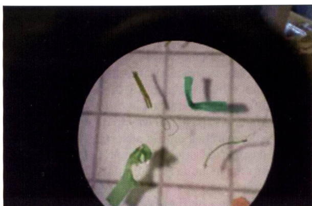
Fig. 6. Micro plastic fibers from Lake Geneva.