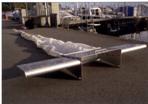
Fig. 1. The Manta trawl used to sample microplastics. Equipped with a 300 \mu\text{m} sieve, its mouth is 60 cm wide and dips 25 cm into the water.

The fishes and birds were collected by a fisherman on Lake Geneva at various locations. The contents of the intestines were collected, dried and observed with a stereo microscope first dry and then in water to find plastic fragments.