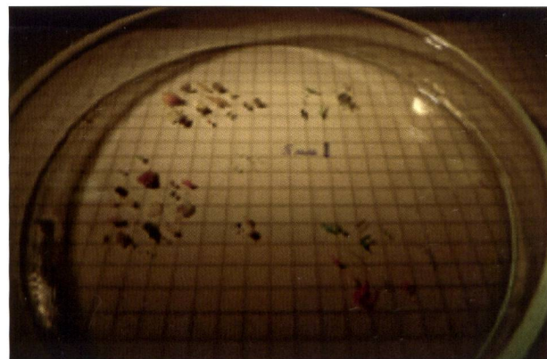
Fig. 4. Microplastics found in Lake Geneva using the Manta trawl.

collected along a distance of roughly 3.7 km, trawling about 2222 m 2 on Lake Geneva, between Vidy and Saint-Sulpice near Lausanne. Once dried and observed through the stereo microscope, a number of plastic particles have been counted as shown on Table 3.