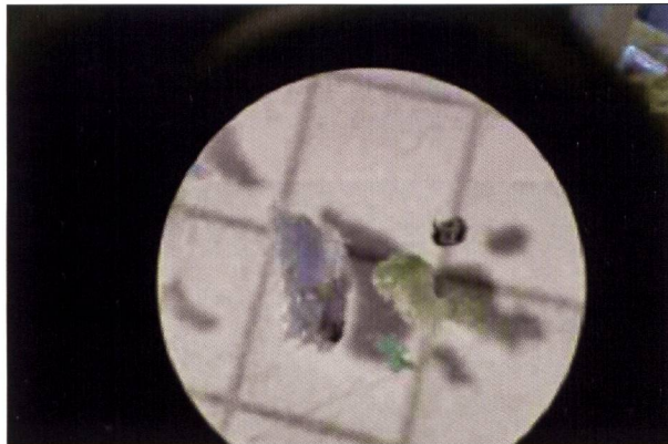
Fig. 7. Secondary microplastics from Lake Geneva.