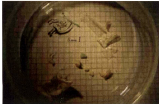
Fig. 3. Macroplastics found in Lake Geneva using the Manta trawl.

Among the collected samples on Lake Geneva, only one could be analyzed in the lab due to adverse sampling conditions: few samples could be collected, and all others were useless due to large amounts of pollens saturating the water surface during the sampling period, and thus the samples. The valid sample was