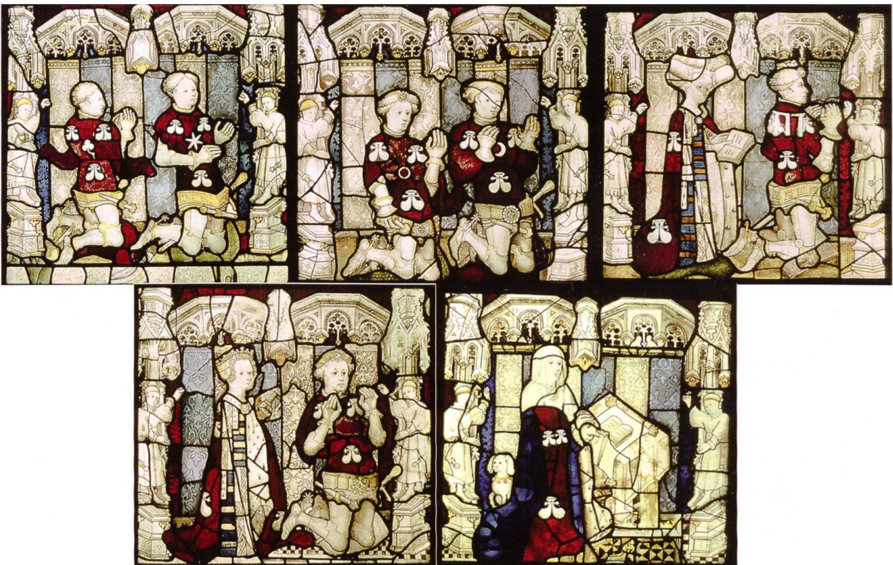
Roos family St William window

of friends and kinsfolk on a tomb would enable them to benefit from the prayers being said for the deceased. The benefit might also work in the opposite direction: placing the arms of revered saints and great heroes of the past in a church encouraged them to watch over it. Their spiritual presence in the building thus secured would facilitate their readiness to intercede in heaven for the church and for those who supported it.