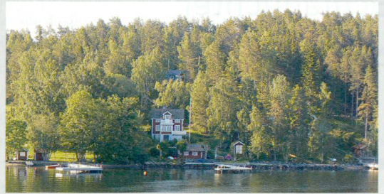
Typical landscape between Helsinki and Stockholm.

Walking in the Kaivopuisto park in Helsinki and on the sea front, was the occasion to discover other landscape man-