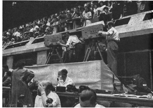
Fig. 1. The new «CPS» cameras in action at the Olympic Games (Swimming events)

any inherent noise. Although it is still undergoing development and is expected to be further improved, it already shows much promise and should prove particularly valuable for use out of doors in bad light as well as for theatres and other indoor subjects under their normal lighting conditions.