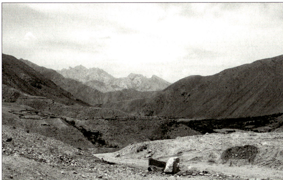
Trockenheit in Afghanistan.

upkeep for the waters they receive in excess of basic human needs. Tajikistan is now looking at the Kyrgyz model and is likely to present a similar argument to support their claims for greater help with infrastructure upkeep. If Kyrgyzstan (and with it Tajikistan and in the longer term possibly Afghanistan) can force the issue on water payments it means that the 1992 Almaty Agreement is no longer valid.