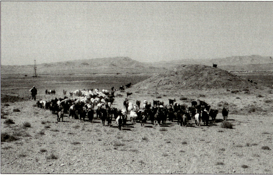
Steppe von Kohsan, Afghanistan (westlich von Herat, an der Grenze zum Iran).

Although energy production is important it is irrigated agriculture that remain the mainstay for much of Central Asia's society. Output from agriculture accounts for between 10 and 39% of GDP and nearly 45% of the population is directly employed in the agricultural sector.