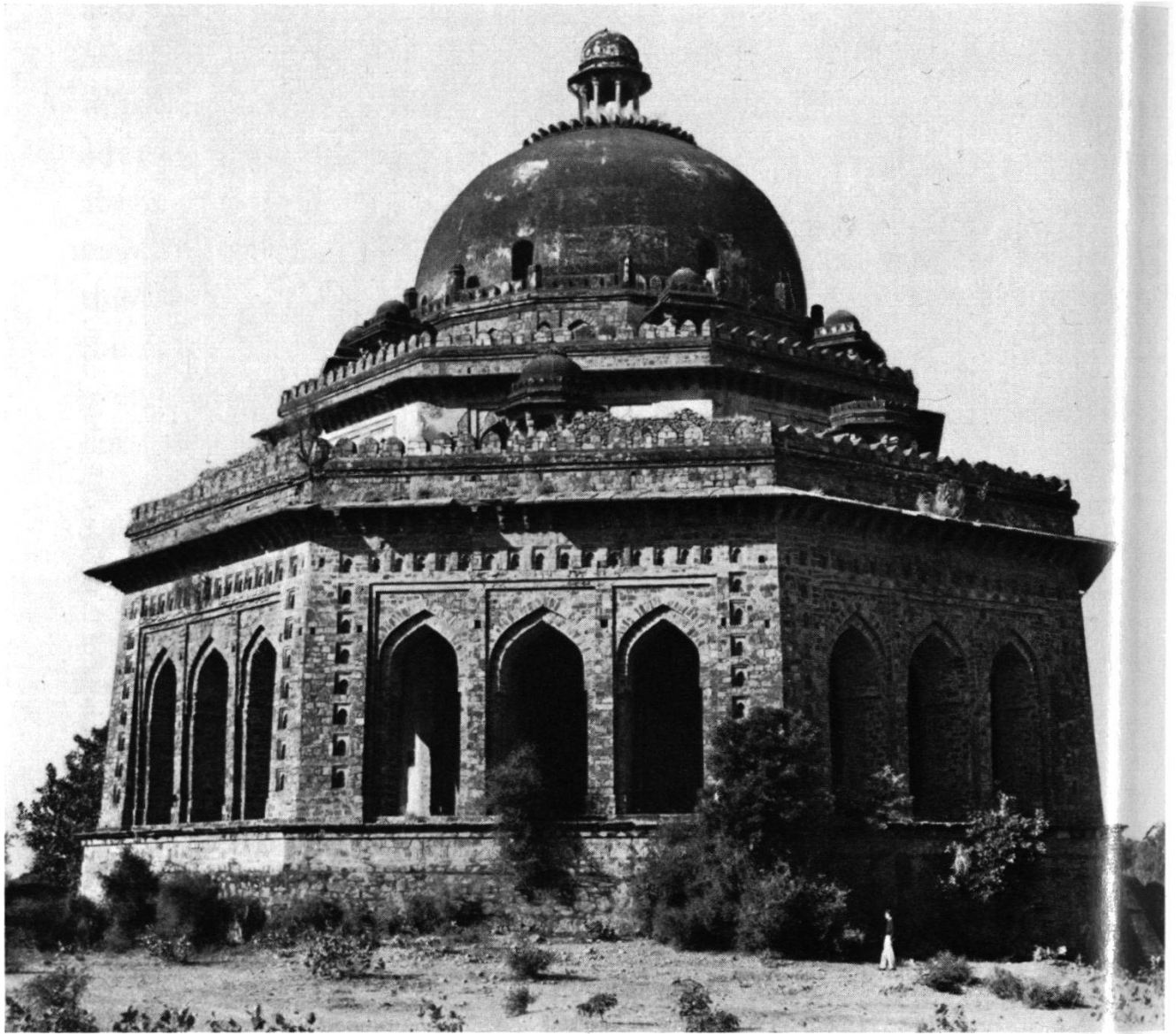
Plate 2. Mausoleum of 'Alā al-Dīn 'Ālam Shab Lodī at Tejara (Alwar).