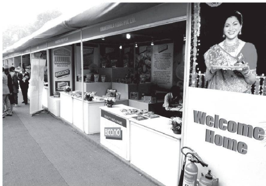
Illustration 3: Engaging the “global Indian family”: Stall at the 8th Pravasi Bhartiya Divas (“Day of the Indians abroad”) organized by the Ministry of Overseas Indian Affairs 2010 in Delhi

America and Australia. On the one hand, the diasporas displayed the Western consumer culture during their visits back home, fuelling the social aspirations and consumerist imaginations of the growing Indian middle class. On the other hand, the success story of the Indian entrepreneurs in Silicon Valley offered an important narrative to showcase world-class Indians abroad, and along with it India as an emerging super-power. In the 1990s, in Bollywood cinema particular narratives about diasporic subjects were created, catering to both the nostalgic feelings of the diaspora, as well as displaying a globalizing India; combining Western material wealth, while still nourishing Indian culture. 35 Since the late 1990s, the government of India began fostering an active diaspora policy with a dual citizenship scheme (Overseas Citizenship of India) and the establishment of a Ministry of Overseas Indian Affairs. With this policy the Indian state created an inclusive narrative of the “global Indian family” in order to mobilize persons of Indian origin to participate in India’s economic growth story. 36