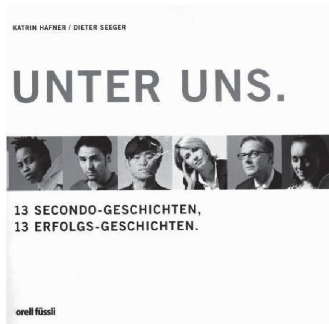
Illustration 5a: Cool Cosmopolitans vs. unassimilatable Others: Cover of the book Among Us (2007) portraying 13 successful “secondos” ...

Looking at subject-making of second generation Indians, an ethnic signature is inscribed into the state, capitalism, and popular culture, which seems to be at the core of current globalization processes. As Stuart Hall argues, neo-liberal globalization, instead of erasing cultural difference, stages and commodifies cultural difference as a way of linking global capital to local places. The commodification of the “exotic Other” enables one to make sense of globalization, while identifying with a cosmopolitan ideal. 41 Hence, being produced in the global logic of consumption and production, the subjectivities of second generation Indians are also embedded in technologies which produce and reproduce patterns of social inequality and segregation hidden at first sight. 42 In the case of Switzerland, the public representation and self-fashioning of the second generation is divided by class. Second generation youths with middle class backgrounds in advertisement, political debate, and cultural production are often looked at as “cool cosmopolitans”, representing a liberal globalizing Switzerland. In contrast, working class Ex-Yugoslavians and Muslims, especially in political debate and the news, are represented as the “unassimilatable, criminal Oriental”. 43