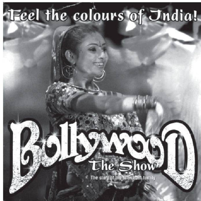
Illustration 2: Exoticising India: Flyer for a Bollywood Dance Musical in 2008

The new multicultural consumerism produced a totally different way of subjectification if compared to the assimilationist regime. While the latter disciplined second generation Indians in Switzerland to avoid ethnic self-representation in public, the former gratifies the self fashioning of the “exotic Other”. Intended or not, the following self-representation as “Indian” on Maya’s homepage is very well embedded within a multiculturalist idiom of authenticity, or as it has been called “the specter, which haunts the commodification of culture everywhere” 29 :