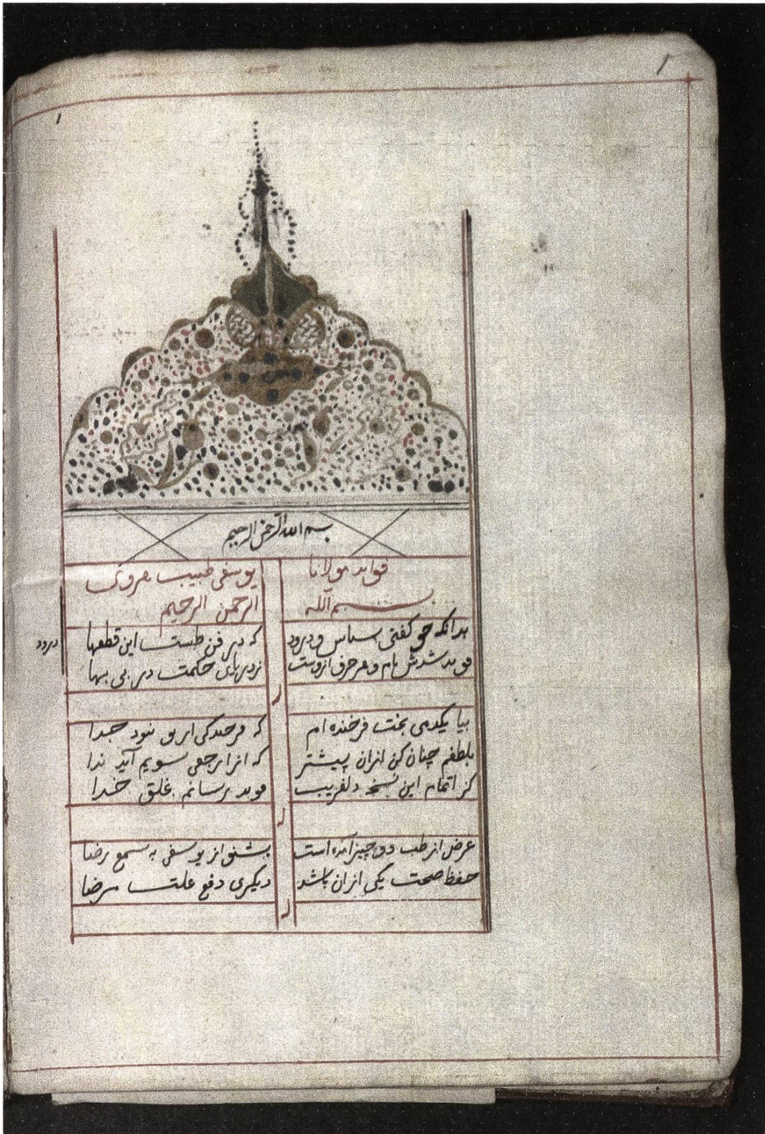
Figure 2: MS Leipzig B. Or. 250 f. 1v (by courtesy of Universitätsbibliothek Leipzig).