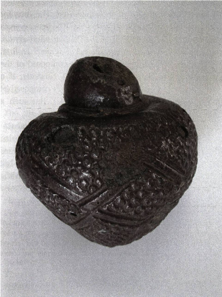
Figure 1: Sphero-conical vessel, 13th/14th c. CE (?), University of Zurich, Institute of Asian and Oriental Studies.

mentioned in the context of various therapies. For example, in a chapter on lice, the following prescription is given: 23