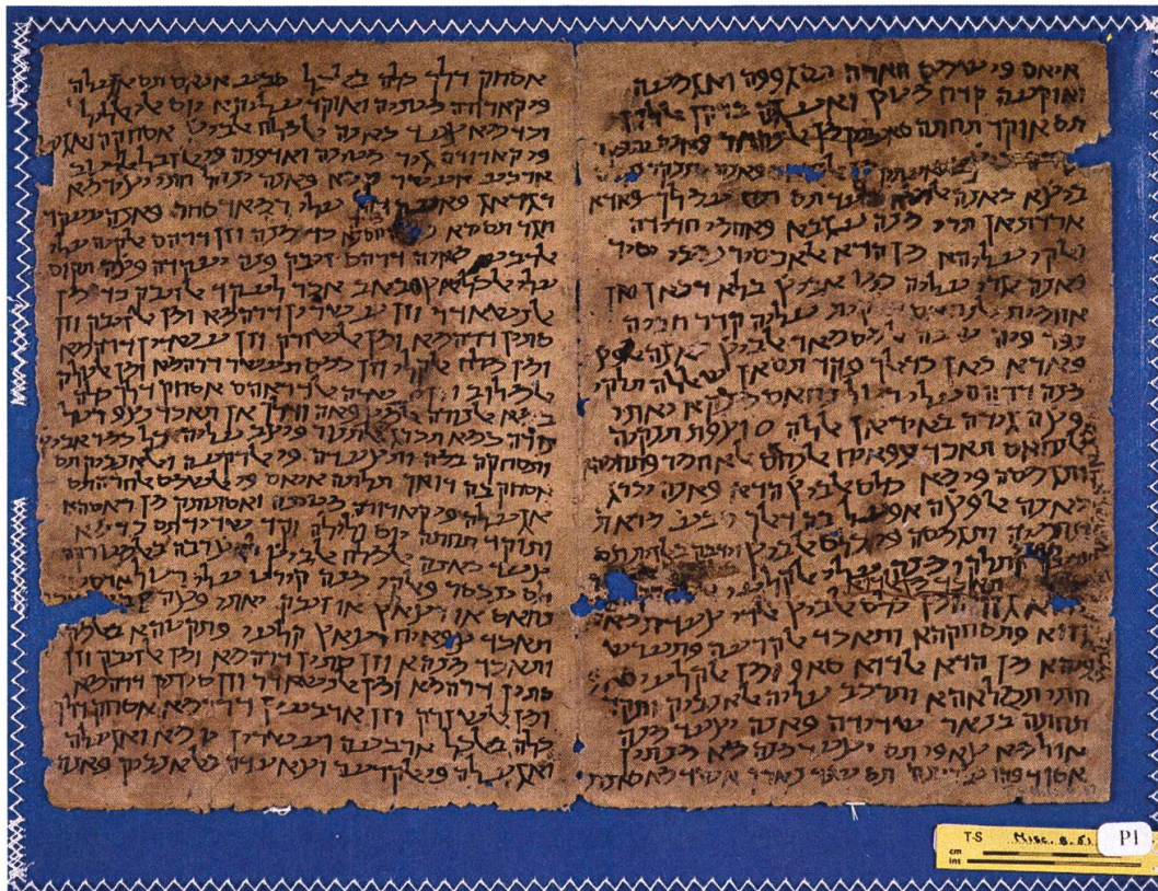
Figure 1: Cambridge University Library, T-S Misc.8.51 recto.