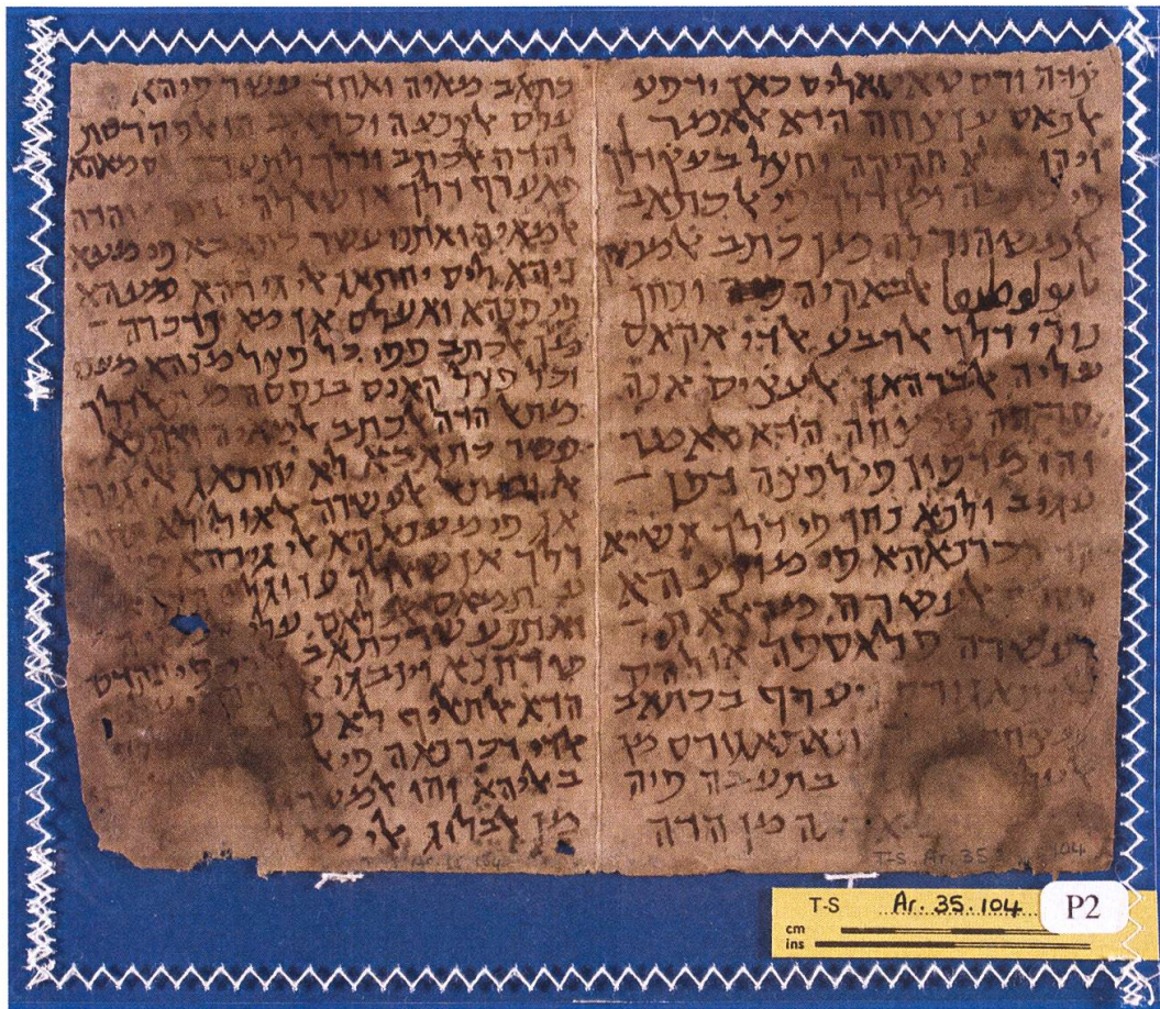
Figure 4: Cambridge University Library, T-S Ar.35.104, P2 1 recto and 3 verso .