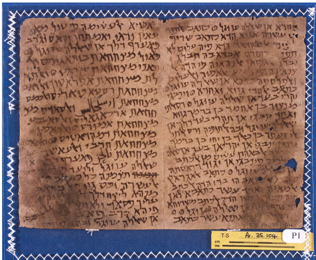
Figure 3: Cambridge University Library, T-S Ar.35.104, P11 recto and 2 verso .

فأول مصححات بوتاغورس الثاني مصححات سقراط • والثالث مصححات أفلاطون والرابع مصححات رسطاطاليس الخمس مصححات ارستجالس والسادس مصححات اركاجاليس والسابع مصححات امورس • والثامن مصححات دمقراطيس • التاسع مصححات حربي والعاشر مصححاتنا نحن فاعرف ذلك إن شاء الله عز وجل