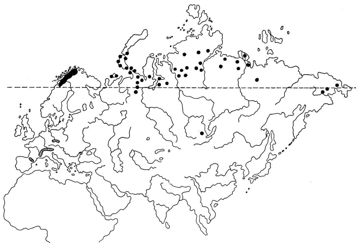
Fig. 23. Distribution of Antennaria villifera Boriss. and A. carpatica (Wahlenb.) Bluff et Fingerh. s.str. in Europe and Asia.