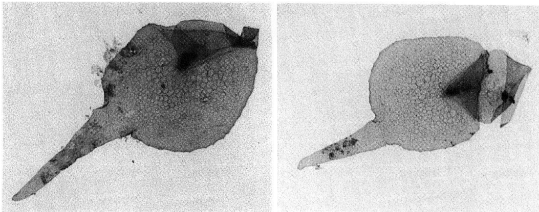
Fig. 1. Wolffiella caudata from the type collection. Transparent sight (x 30)

Frons parte proxima summa aqua natans, parte distante inundata, ovalis vel linguaeformis, prolongata in partem angustiore, 2-8 mm longa, 2-5 mm lata (pars angustior 1-4 mm longa, 0.4-0.8 mm lata, subacuta), cum cellulis pigmentiferis, cum lacunis aerenchymaticis in toto parte proxima. Stomata 0-4. Angulus sacculi gemmiferi 120°-150°; paries inferior sacculi non elonga-