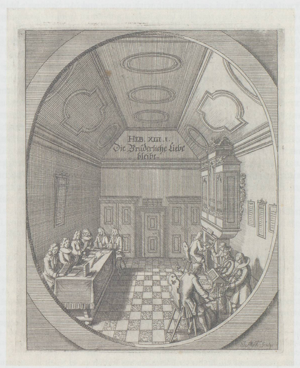
Fig. 1: Frontispiece of collegium musicum zur deutschen Schule, Zürich 1713. Zürich Central Library, CH-Zz AMG Q 341.

and to the detriment of vocal music" ("die Instrumentalmusic nicht allzuvil und zum Nachtheil der Vocalmusic getriben").<sup>63</sup> That the collegium musicum zur deutschen Schule acquired Vivaldi's Suonate da camera op. 1 containing dance movements, together with trio sonatas of Corelli, is an impressive testament to the exalted place of these two composers. Corelli and Vivaldi were seen as the composers of instrumental music in Zürich at that time.<sup>64</sup>