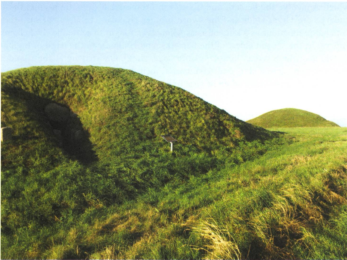
Image 2: The Bronze Age burial-mounds of Dalby Rævehøje and Vagthøje on Samsø

Örvar-Odds saga details the topography and construction of the island burial-mounds: Angantýr and his brothers are buried in one place, earth is piled up and faced with timber, then turf and sand placed on top, while Oddr's own men are laid in a particular mound on the beach. The separate sites not only mirror the actual monuments on Samsø, where one sizeable mound (Alstrup Jættestue) is located on the north-west shore, but also manifest the crucial distinction between the evil and the good dead. Oddr's nameless crew lie quietly in their mound, but the mound(s) of Angantýr and his brothers become a place of horror, where the dead walk and talk and where supernatural fire burns in the middle of the night.