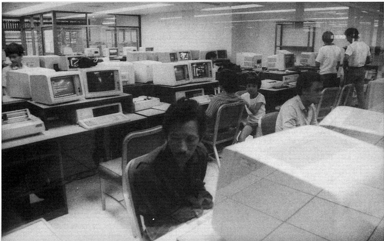
Microcomputer room in Computer Centre