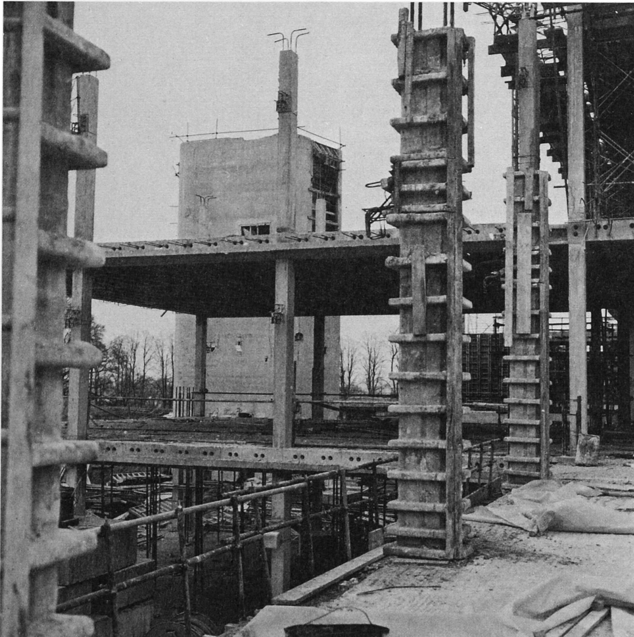
Section of works showing typical floor arrangement