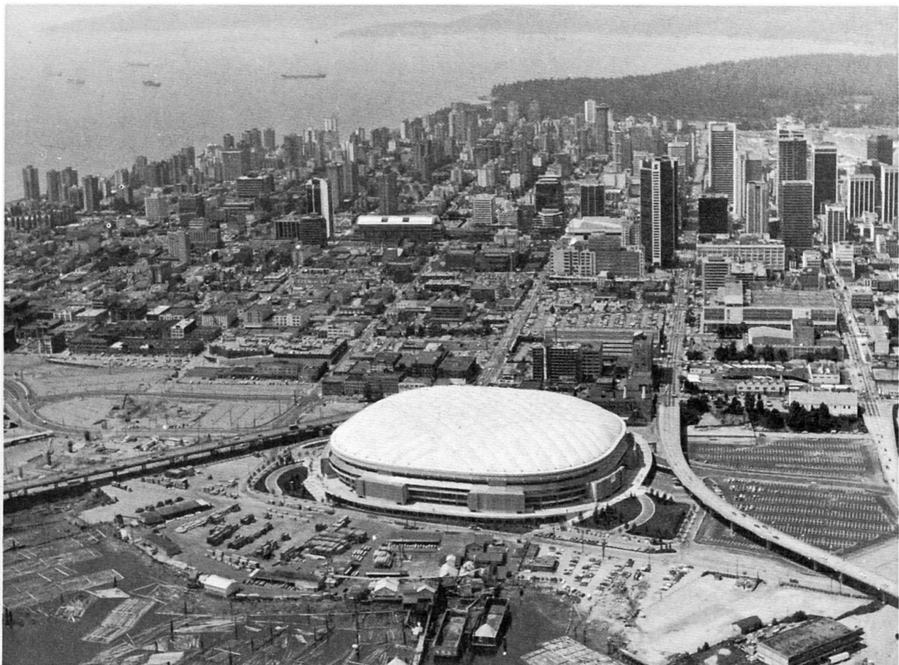
Fig. 1 Stadium at B.C. Place

Soil conditions were favourable, with good glacial till near the surface over most of the site. All foundations are spread footings, with only one minor exception. Allowable bearing pressure was 380 kN/m 2 . This structure is in seismic Zone 3. The light weight of the roof was a major factor in reducing the cost of seismic resistance.