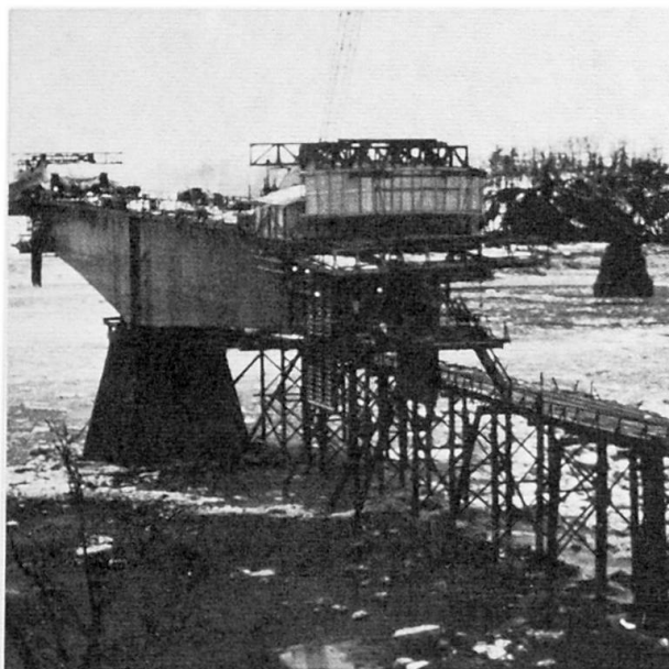
Fig. 1 East span advancing under winter conditions