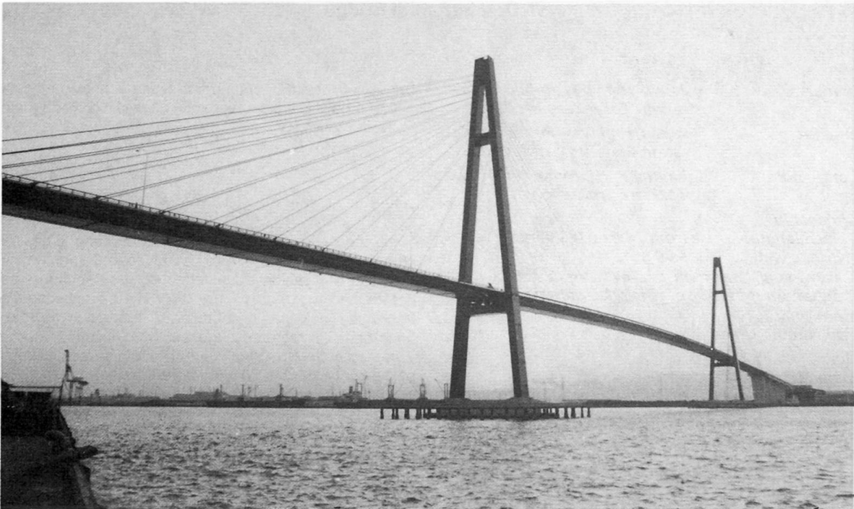
View of the bridge