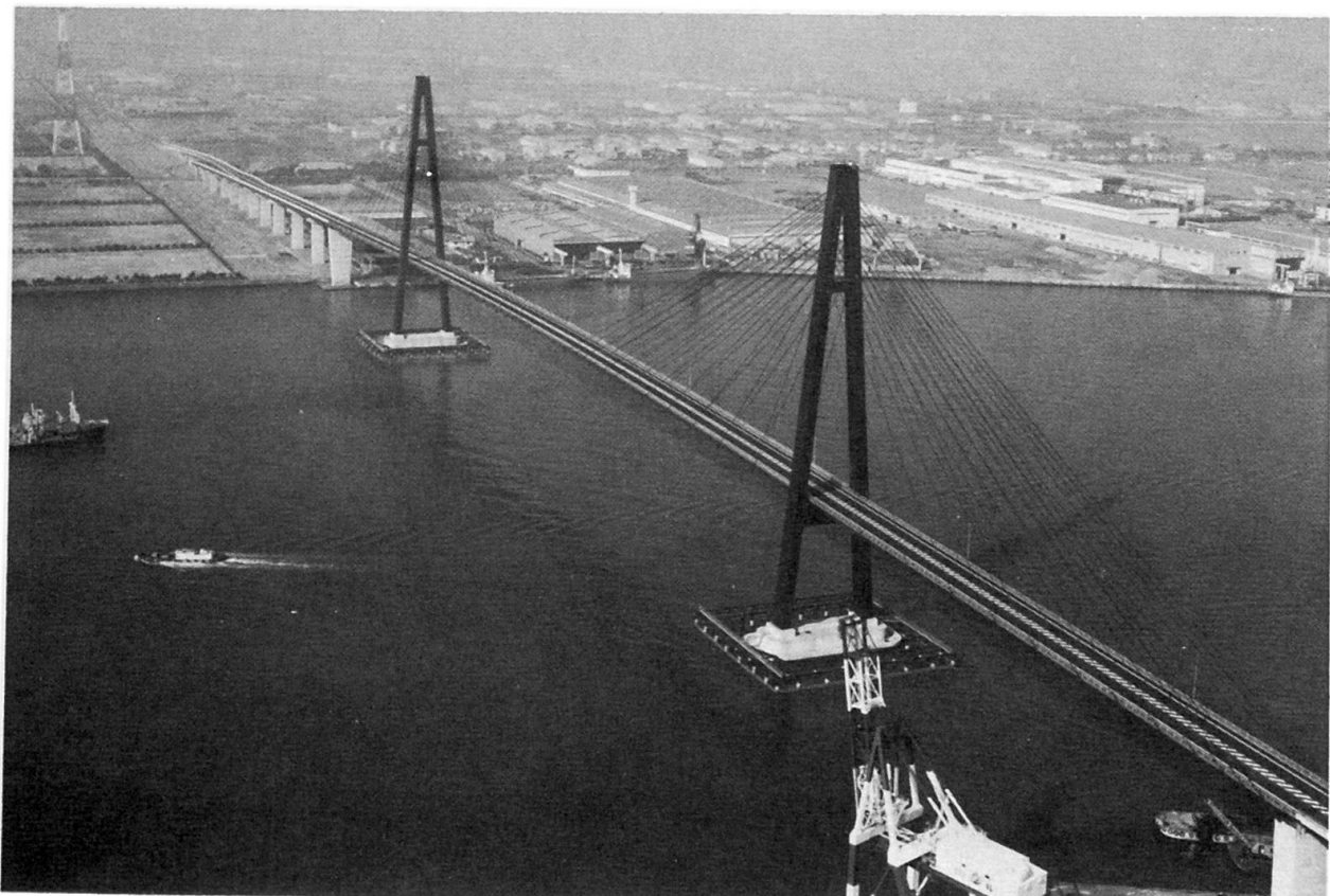
Meiko-Nishi Bridge, Nagoya

This bridge is a steel cable-stayed bridge with three spans of (175 + 405 + 175 m). The box-girder type with an orthotropic deck is a trapezoidal 3-cell box-section of depth of 2.8 m. Towers are A-frames fixed to piers. The longitudinal cable configuration is the fan type of twelve stay cables.