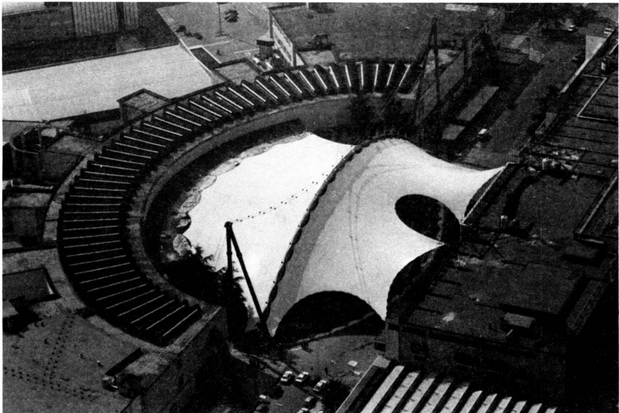
Fig. 2 Aerial view of the construction

The main system, oriented along the principal axis of the roof surface, is formed of a pre-stressed cable-truss which has a span of 125 m.