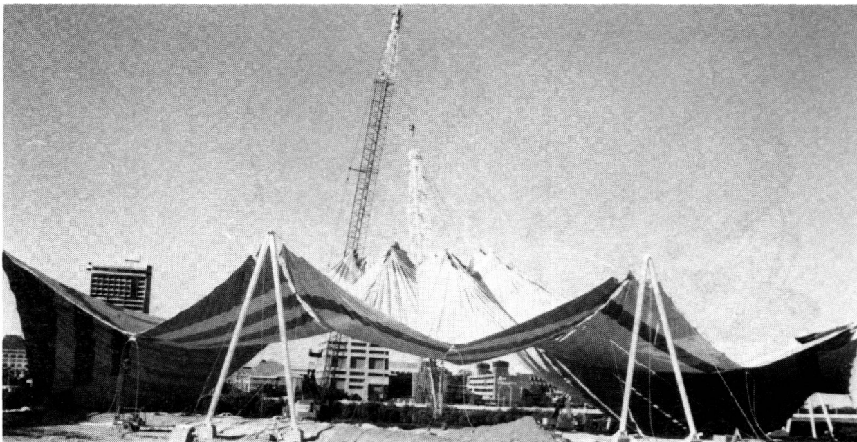
Fig. 3 Raising the membrane for one of the structures