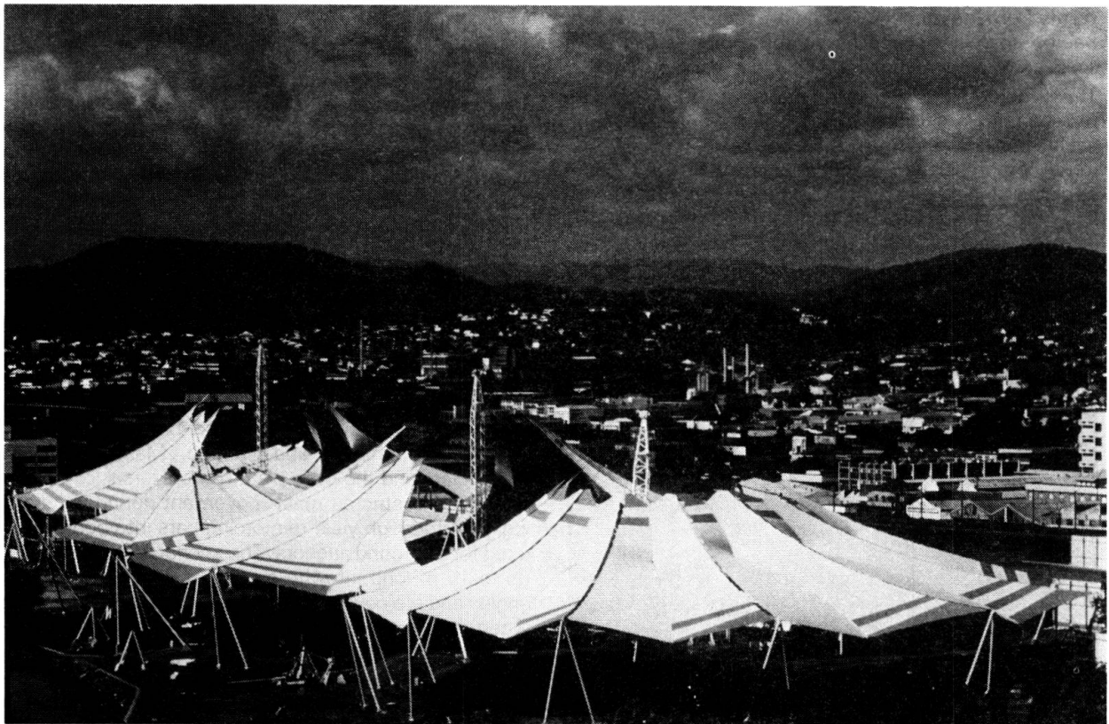
Fig. 1 Overall view of the shade structures

The structures are supported on 5 masts (3 of which are inclined) 30 to 50 metres high. At the perimeter inclined tubular bi-pods, tri-pods and X-shaped pods support the membrane at a height of approximately 15 metres. From the mast heads steel cables, with sockets and fittings to accomodate for tolerances and stressing requirements, span to the perimeter supports. Tiedown cables with pulling points on the membrane are fixed to aerial points or to nodes close to the mast. The membrane consists of a PVC-coated polyester fabric Type IV Tensile strength 150 kN/metre in both directions.