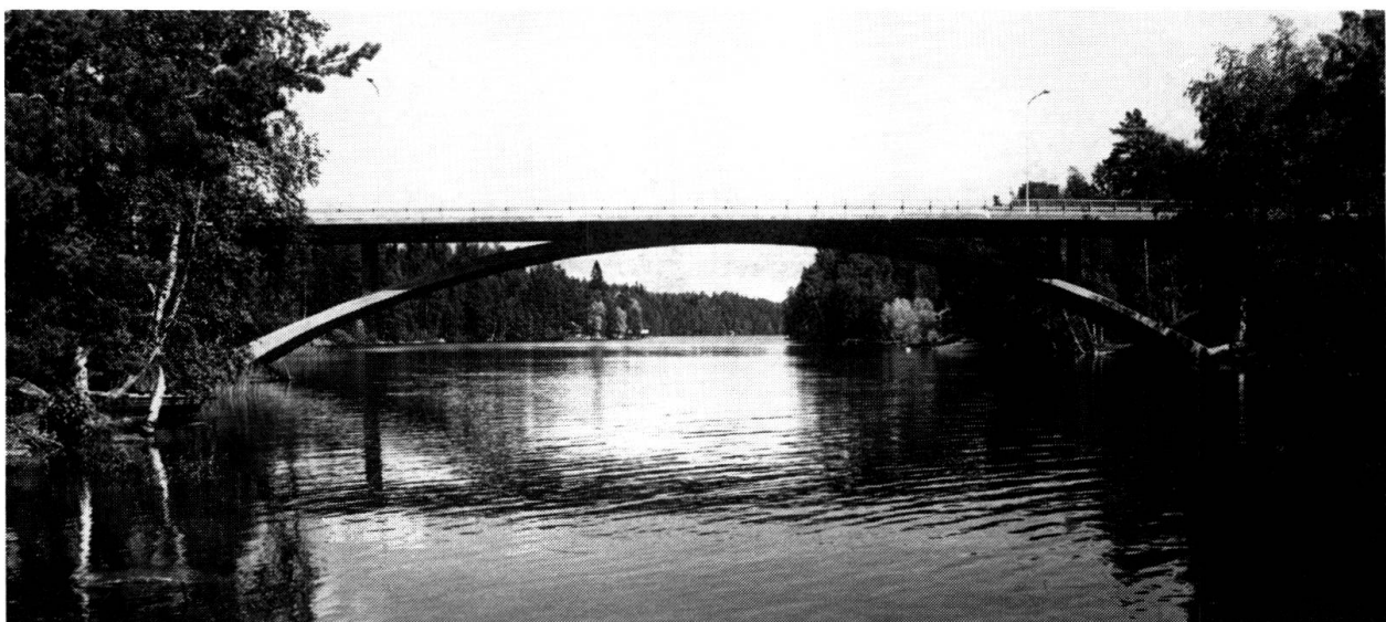
Fig. 1 Kaitavesi bridge

At the arch springings 4.0 m long stripes were left to be concreted during the last work phase. This was done in order to minimize the secondary stresses in the arch, the influence of shrinkage and of the settlement of the scaffolding.