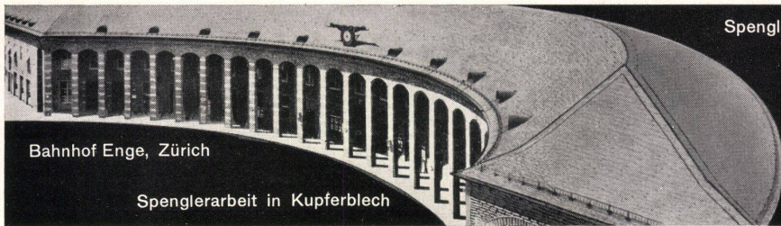
Bahnhof Enge, Zürich