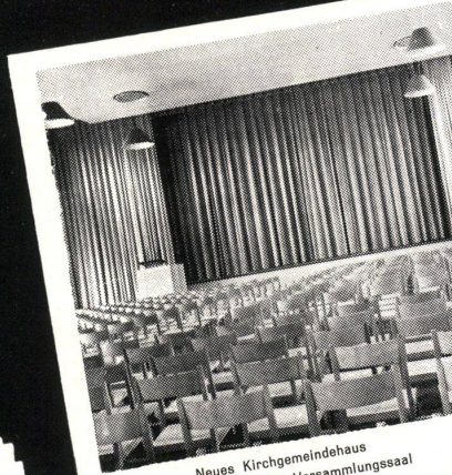
Neues Kirchgemeindehaus Winterthur-Veltheim: Versammlungssaal