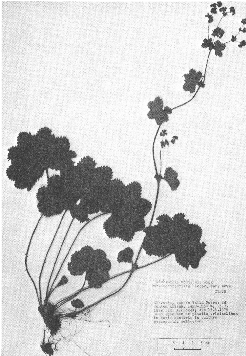
Fig. 4. — Alchemilla monticola Opiz var. contractilis Plocek, holotype.