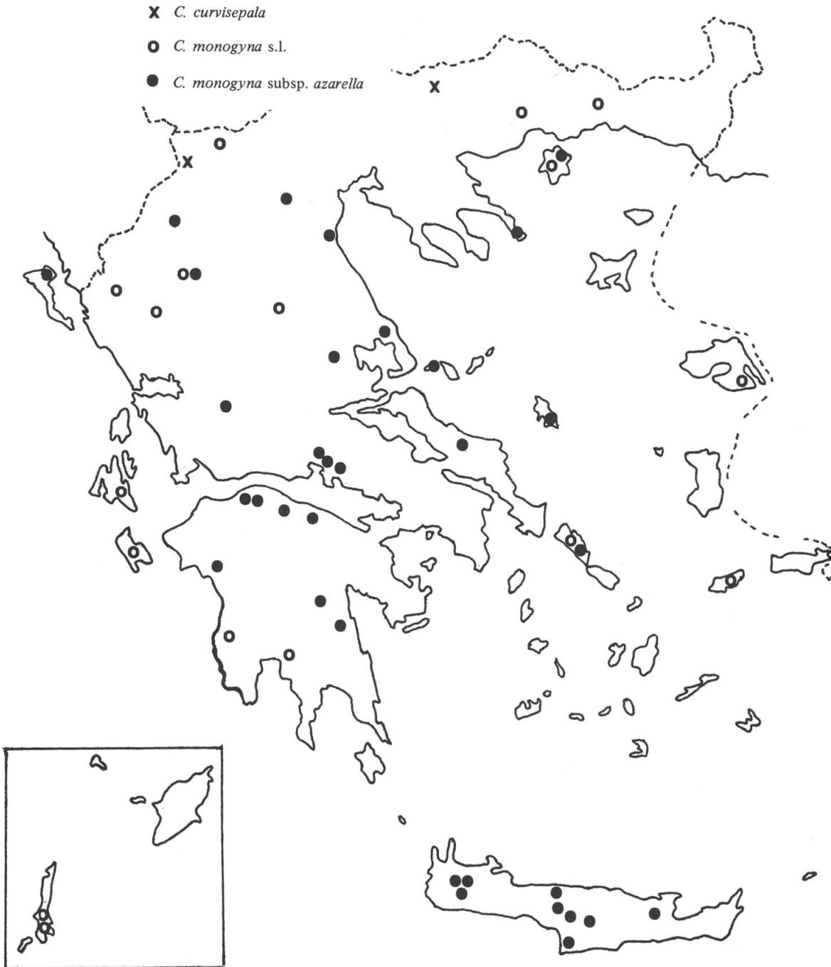
Fig. 2. — Distribution of Crataegus sect. Crataegus in Greece.