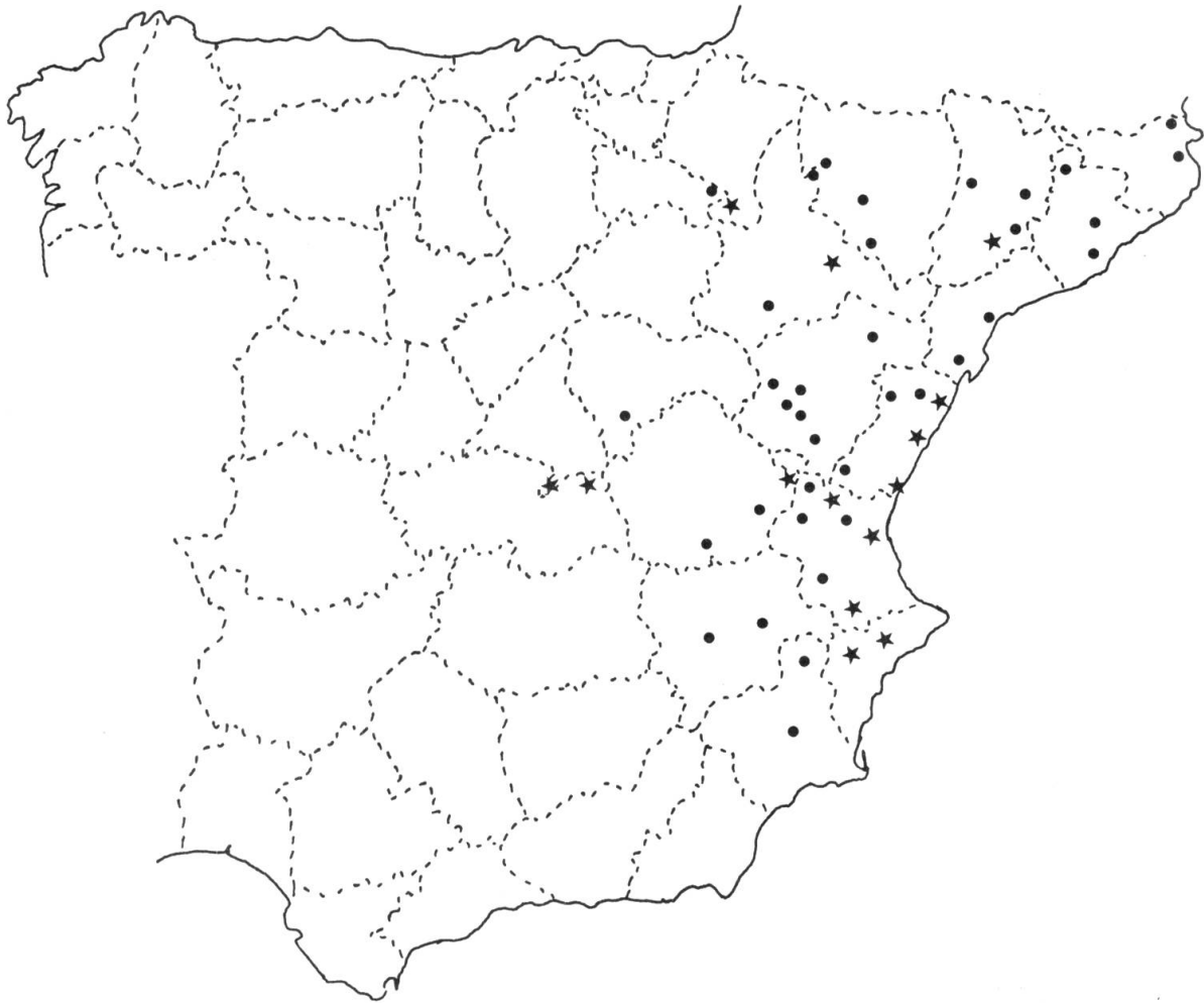
Fig. 5. — Distribution of the studied localities of Amarantho delilei-Diplotaxietum erucoidis : ● diplotaxietosum erucoidis ; ★ amaranthetosum blitoidis .