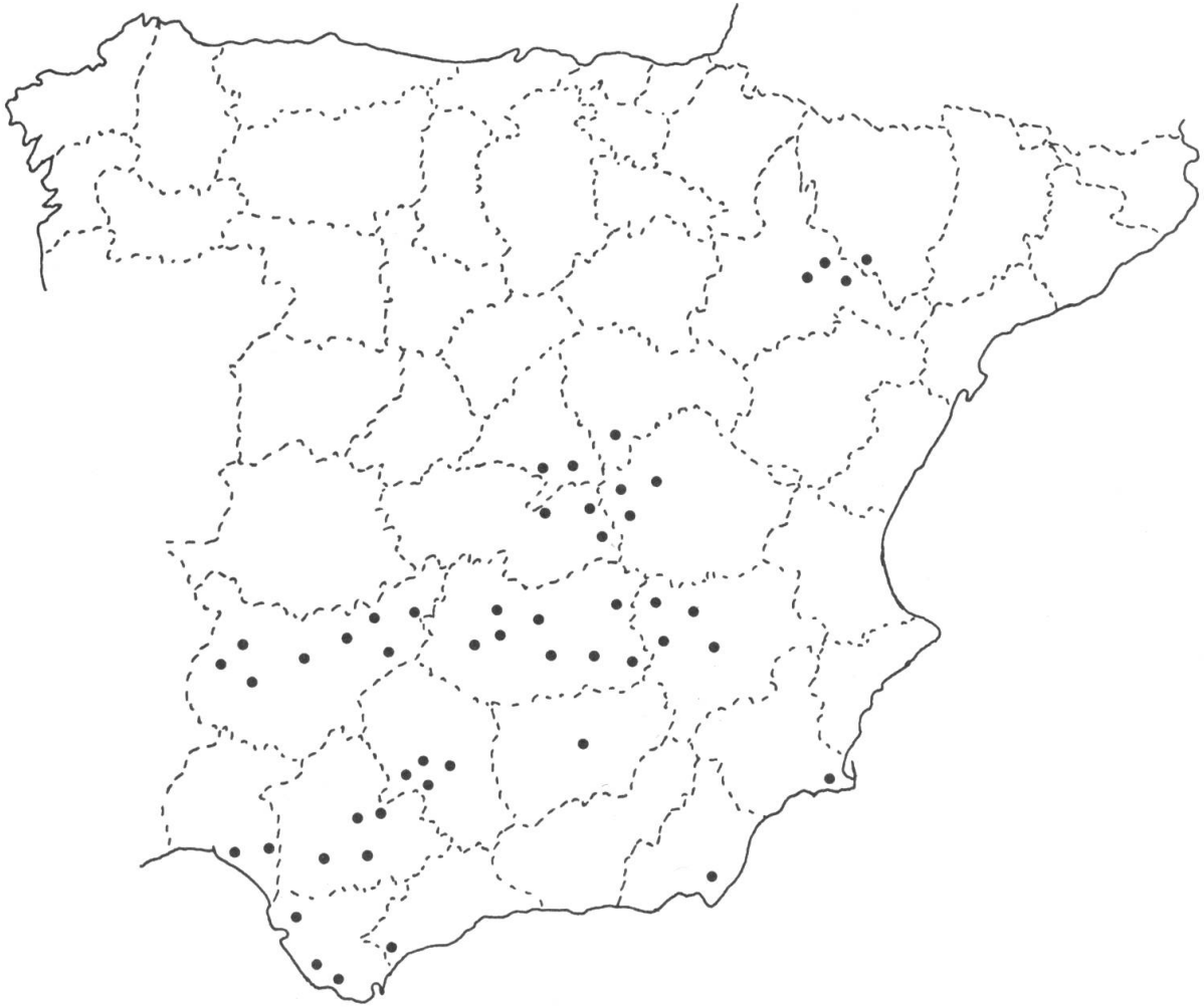
Fig. 3. — Distribution of the studied localities of Kickxio lanigeræ-Chrozophoretum tinctoriae .