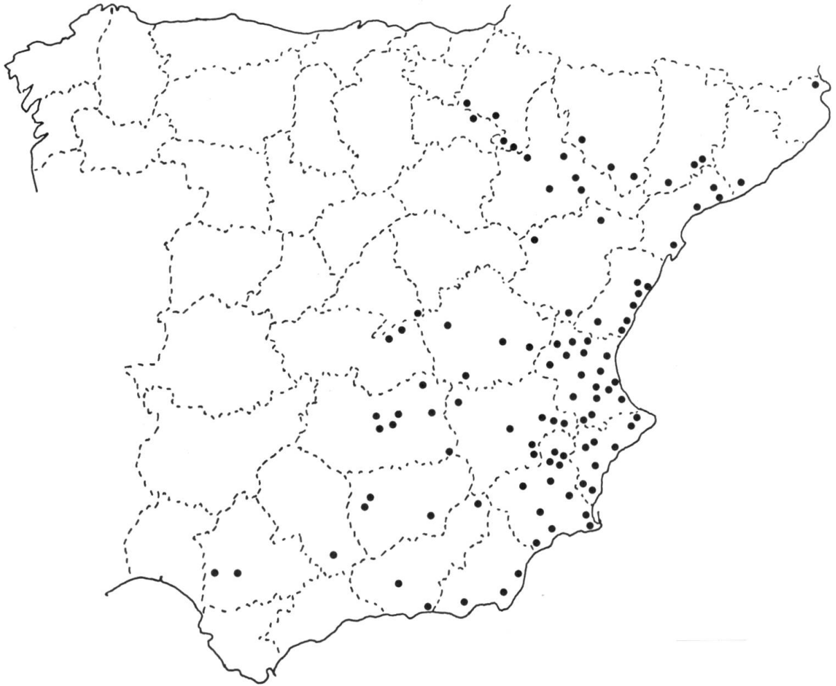
Fig. 4. — Distribution of the studied localities localities of Chenopodio albi-Amaranthenum blitoidis .