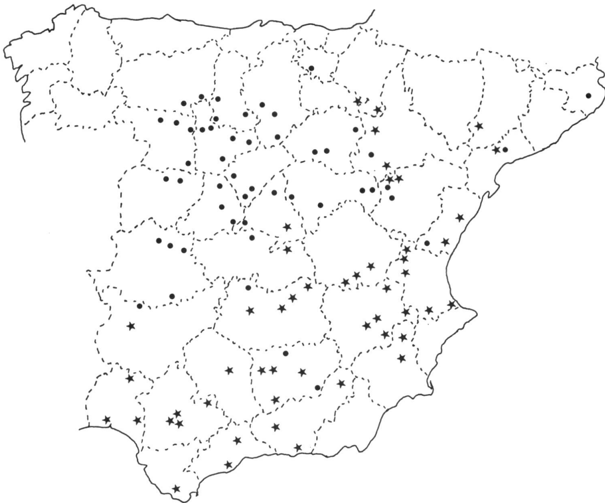
Fig. 2. — Distribution of the studied localities of Eragrostio majoris-Chenopodietum botryos : ● chenopodietosum botryos ; ★ amaranthetosum blitoidis .