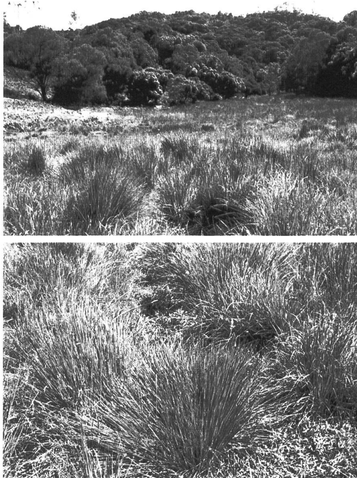
Fig. 2. – Nilgiris swamps with Eriochrysis rangacharii C. E. C. Fisch., near a mountane rain forest, locally called ‘shola’ ( top ). Eriochrysis rangacharii with inflorescences ( bottom ).

the Toda’s buffaloes (Fig. 2). The grass was sustainably exploited for almost a thousand years, since the Todas immigrated into the Nilgiris. We could collect it in swamps of the southern parts of the Nilgiris where it grows fairly abundantly.