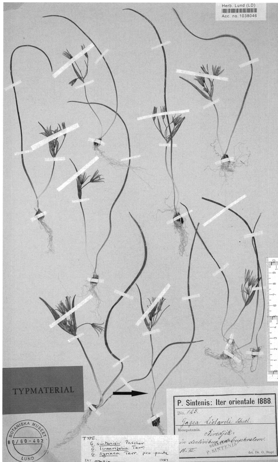
Fig. 3. – Lectotypus of the name Gagea linearifolia A. Terracc. [Sintenis 123, LD]