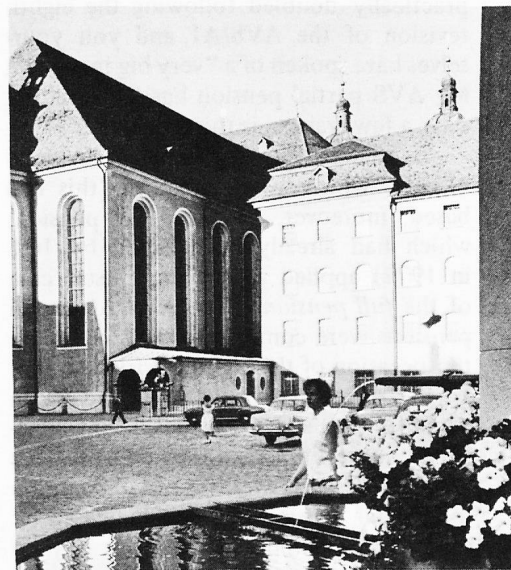
Gallus Square in St. Gall