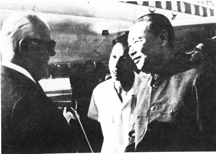
Federal Councillor Pierre Graber is received in Peking by his colleague Tsching Peng Fei

schoolboy enabled archeologists to establish that 400 000 years ago, prehistoric beings lived in Switzerland.