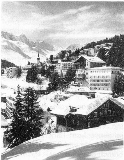
Arosa, one of Switzerland's largest winter sport resorts.

ture when the power constellations wanted to secure the Grisons passes. On one side were Austria, Spain, Milan and on the other Venice, where numerous Engadine emigrants lived, and France. Partisanship led by respected families like the Planta (in favour of the Austrians) and the Salis (Francophile) resulted in bad feuds, in which an adventurous figure like that of Juerg Jenatsch could live life to the full. Between 1649 and 1652, Austria sold her rights to the Grisons, above all to the relief of the Lower Engadine; the partisan struggles abated only gradually. The 18th century may be considered a happy period: politics and schools became aristocratised: the private schools of Haldenstein, Marschlin, were pioneering achievements of educational training; the arts and trade flourished. In 1798, the Grisons, as Canton Rhaetia, were united with the Helvetic Republic by Napoleon and became the 15th Canton of the Confederation as a result of the Acts of Mediation in 1803. The Canton gave itself a new constitution in 1814, but in fact it did not become a uniform political structure until 1854 with the demand