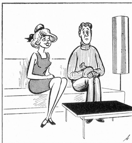
You see, that's why I knitted the arms so long.