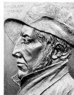
Hunter's head

As poet and narrator he writes above all in his mother tongue, the Ladin of the Engadine (poems, stories, essays, one-act plays, radio plays). More and more, he also writes in German, specially prose and dramatic works, as well as journalistic commentaries which appear in dailies and periodicals at home and abroad. Some of his publications in German are «Sgrafits» (poetry in Romansh and German 1959), Tales (Gute Schriften Zurich 1968), «Arosa» (text for a picture book, RA-Publishers Rapperswil 1972), «That afternoon at Poschiavo» (tales, Reinhardt Basel 1974), «Active Service» 1939–1945 (documentary Ringier Zurich 1975).