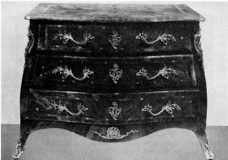
Chest of drawers, Louis XV, Berne.