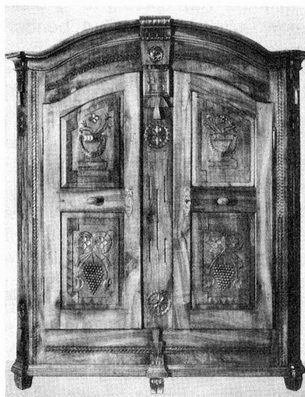
Wardrobe, 1830, Eastern Switzerland

By deliberately simplifying foreign models, we often achieved pieces of furniture in Switzerland, which are striking in their simplicity and clear lines. Nowhere does one find too many ornaments. As the Swiss as peasants or descendants of peasants have deliberately kept to tradition, it often happened that two or even three different styles were mixed in the same piece of