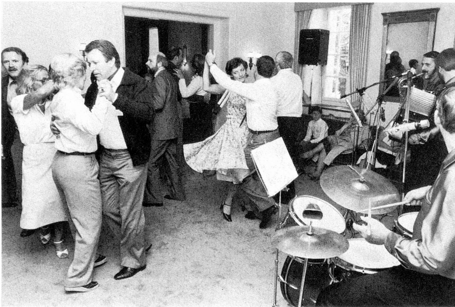
High spirits at the Dance at Bad Attisholz

Federal Government deserved thanks for stating clearly and to the point that being a Swiss abroad is not a thing of folklore: «Again and again I have to admire the energy with which people of all classes and all ages in our nation go abroad to seek a new life, and in doing so find stamina which they would hardly have considered possible earlier.» Federal Councillor Honegger also joined with the Swiss abroad in the hope that further cuts in the contributions to the