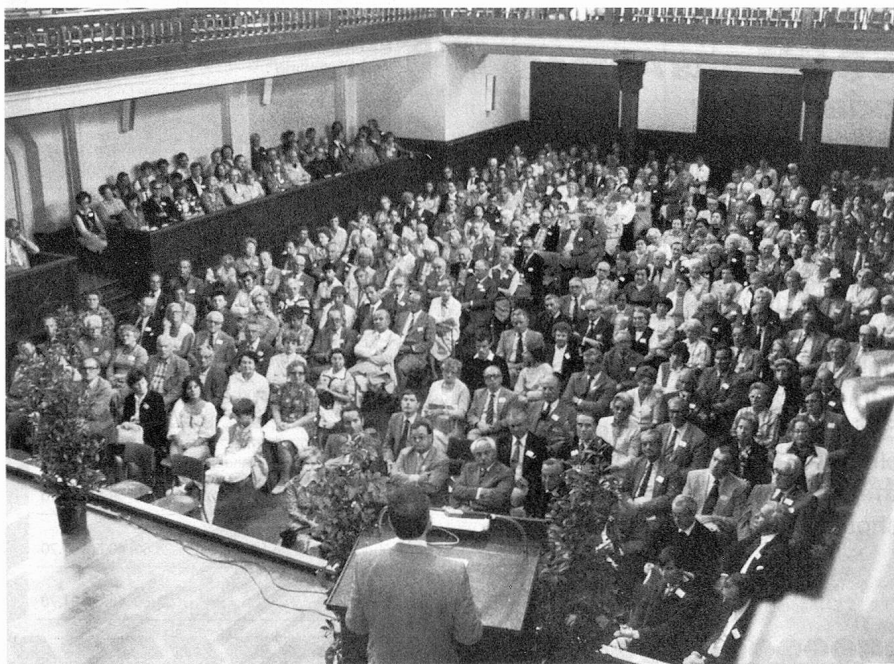
The official opening

When returning to Switzerland not only an unbroken membership in the AHV is impor-