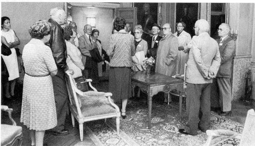
Guided tour of the castle of Waldegg