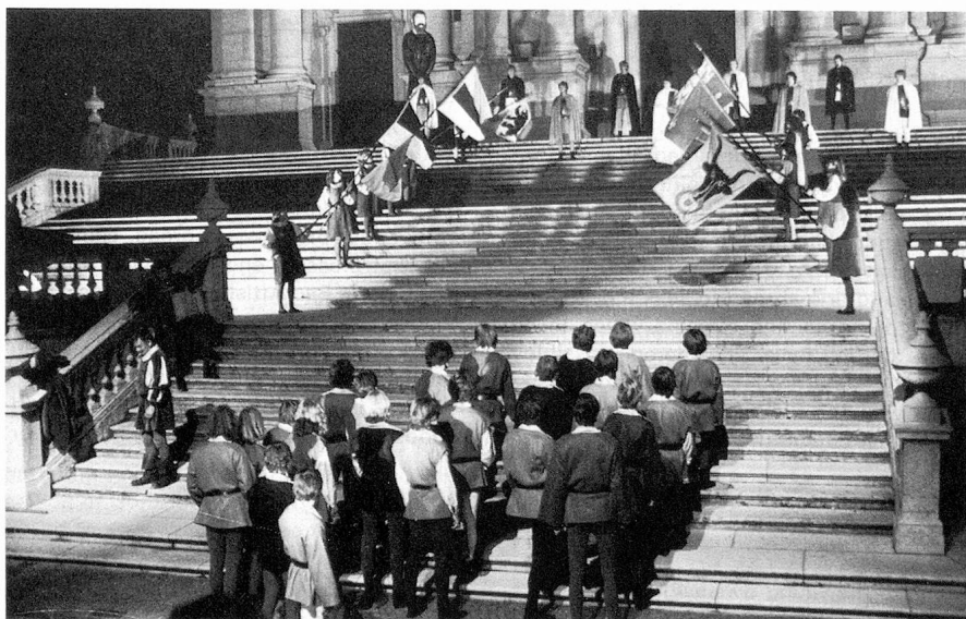
The theatre performance