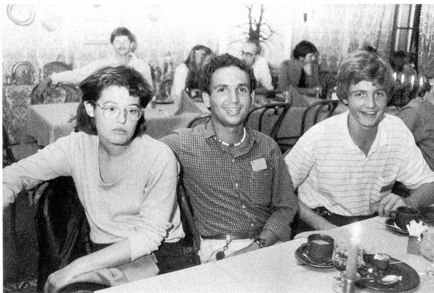
Dinner of the young Swiss abroad