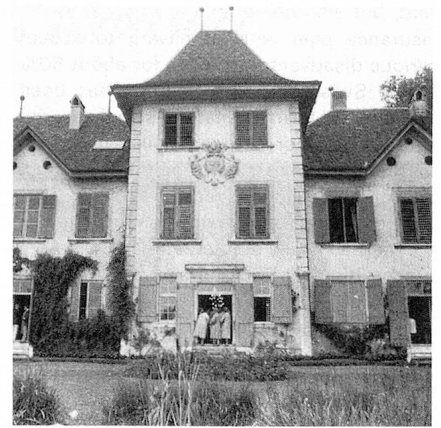
View of the castle of Waldegg