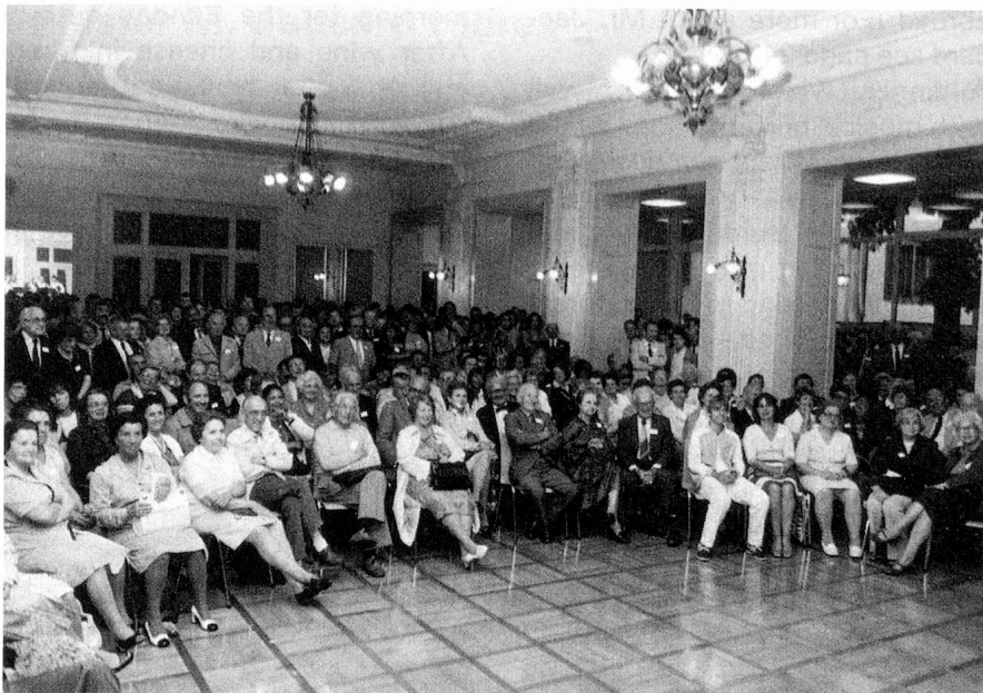
During the official opening