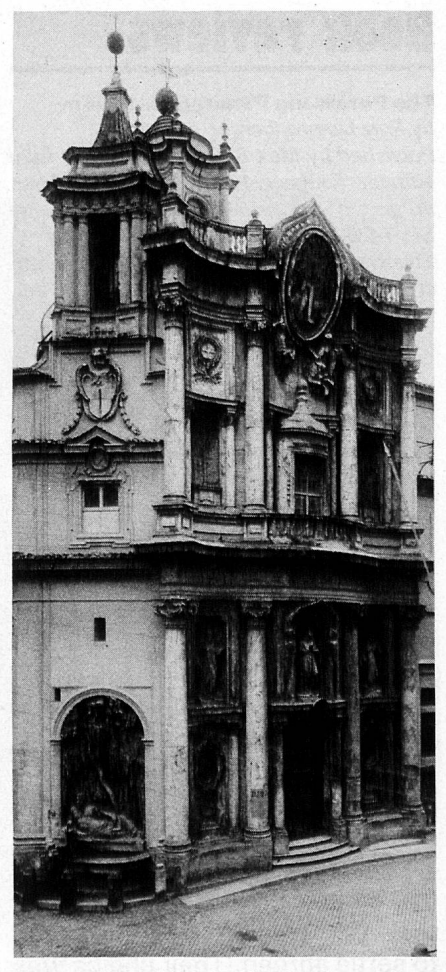
Facade of the Church «St. Charles with the four fountains».

Of the many vast architectural projects of Emperor Bonaparte, only the ambitious Arena (1807) remains, the creation of the state architect Luigi Canonica from