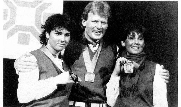
On 16th February 1984, Switzerland won three medals on one day: from left to right: Michela Figini (gold, women's descent), Peter Müller (silver, men's descent), Maria Walliser (silver, women's descent).