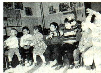
The kindergarten of the Swiss School in Catania, Italy.

FC: As far as the forms of promotion are concerned there are hardly any limitations, provided the Swiss dimension plays an essential part. Of course, the education must be neutral from a political and religious point of view and of general benefit. However, I must qualify this by emphasizing that there is no question of individual assistance being granted to individual Swiss abroad. The applicants must always be an association of Swiss abroad – for example, a group of Swiss parents – or Swiss organizations. The assistance should also benefit as many Swiss children as possible.