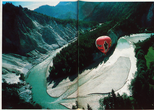
"Switzerland is a small, steep country" – much more up- and down- than sideways..." (Ernest Hemingway).

issues of "National Geographic" dated January 1986 and "Geo" dated February 1987. This is the main image propagated by Switzerland abroad, and this is the image foreigners want to receive. The main attraction of the Swiss exhibition in the "World Showcase" planned by Walt Disney in Florida is to be a 60 metre Matterhorn. Switzerland has been invited to invest Sfr. 17 million in this