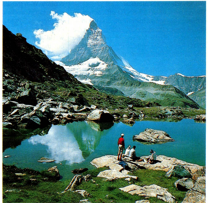
The Matterhorn (in the background) is free advertising for our country.

numerous mountain valleys, and helps to prevent migration from the land. Mountain farming may be typical for Switzerland, but its yield is poor. In many places this prime tourist attraction can only be maintained because tourism brings farmers additional income.