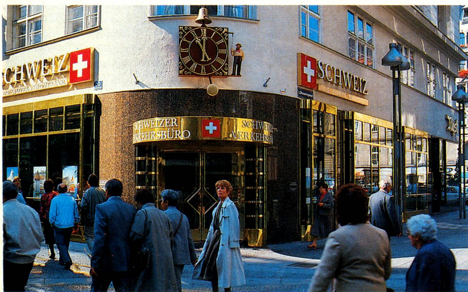
Swiss Tourist Office in Vienna's Kärntnerstrasse.