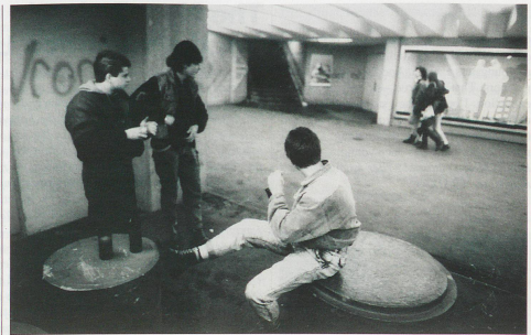
Hostility to foreigners.

My father is a typical Italian. He finds it difficult to come to terms with the fact that I'm growing up. For instance, I always have to be home for the evening meal, and if I want to eat out occasionally I have to tell him a week in advance. Of course I put up a fight against this sort of thing, and I've learned how to