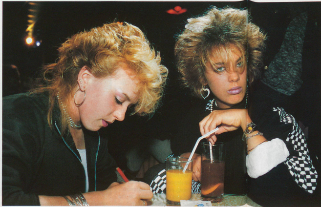
The difficulty of finding oneself. Bored consumerism.

I can't say I have any problems with people older than me. My best friend is 38. I also res-