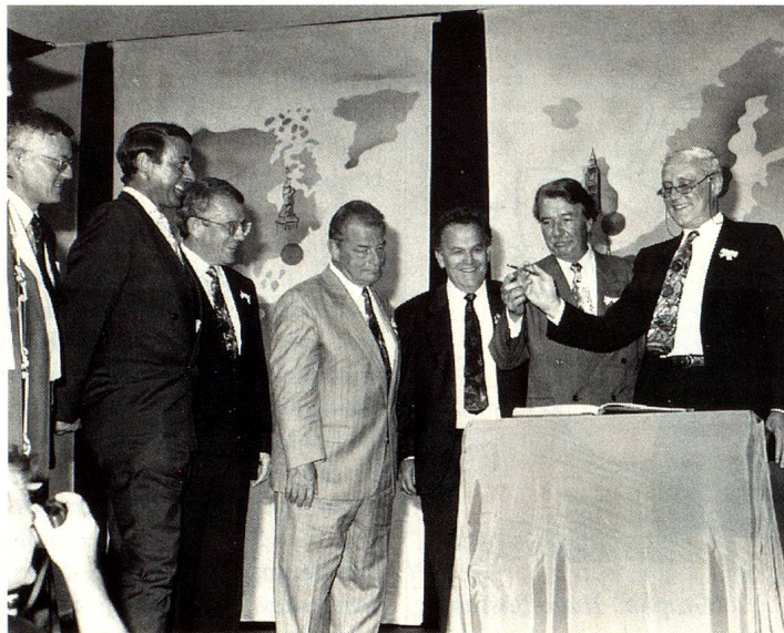
All seven members of the Federal Council sign the official guest book.

«... I congratulate Switzerland on this very special day. May Switzerland remain forever prosperous, may its mountains never crumble and may it keep producing chocolate...» (Indira Varma)