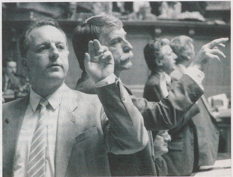
Vote counters at work: How will parliament decide?

Women who have paid their own contributions become entitled to a pension in the month following their