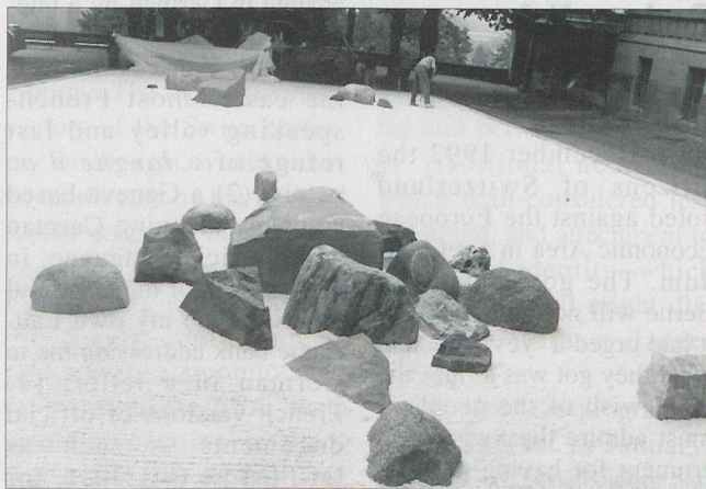
Das Gleichgewicht der Dinge (The Balance of Things) – as reported in the last edition of the Regional News-UK, the stone sculpture in Berne made from rocks collected at locations called Switzerland throughout the world

More than a dozen resorts have made major improvements to existing mountain facilities, taking care to min-