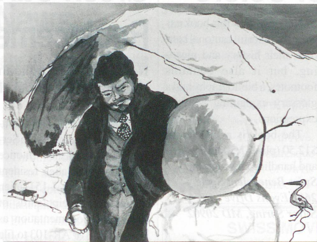
Inspection Medical Hermeneutics: "Switzerland + Medicine" Panel from Lenin's Corridor

The first exhibition this year analyzed how Swiss culture is viewed abroad, more specifically in the former Soviet Union: The Russian artist group "Inspection Medical Hermeneutics" installed a far-reaching work examining the impact of Swiss institutions like the Red Cross and the role that Zurich played for Russian refugees, among other topics. The result was a humorous and challenging installation that was reviewed extensively in the international media.