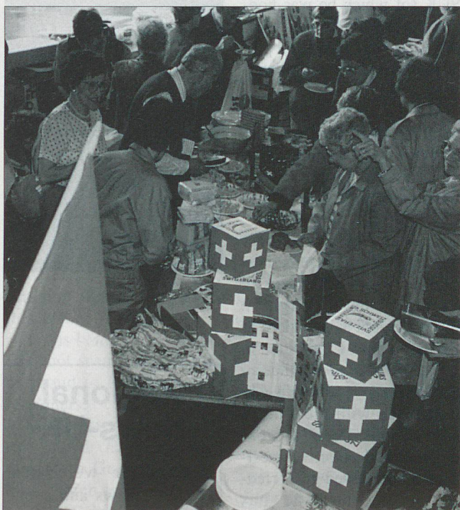
Tyne Tees Swiss Club celebrating Europe