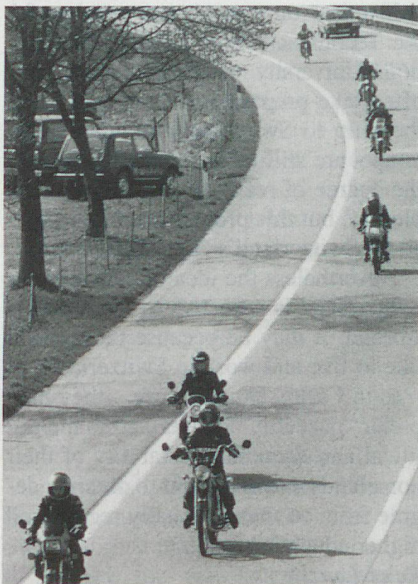
Motorbikes hardly feel the recession: new registrations only 2.5% down.