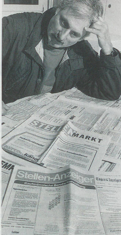
Ever more jobless and ever fewer vacancies: looking for a job is so difficult that resignation and depression are rife.