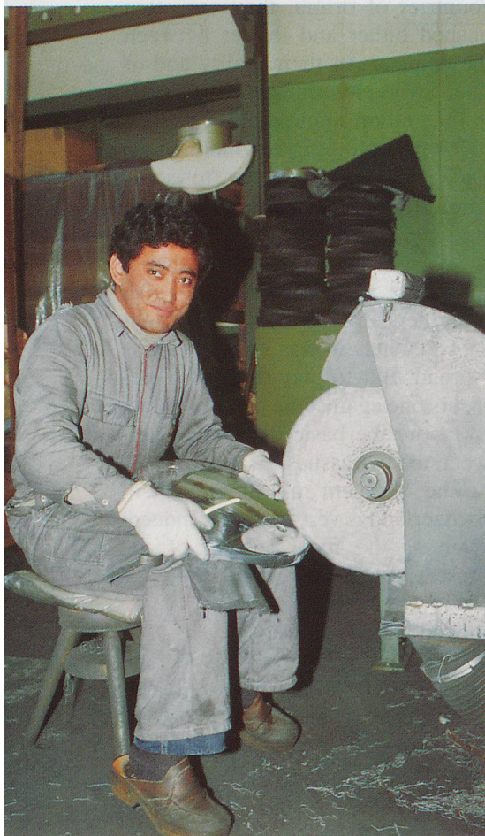
Without foreigners whole economic branches would collapse.